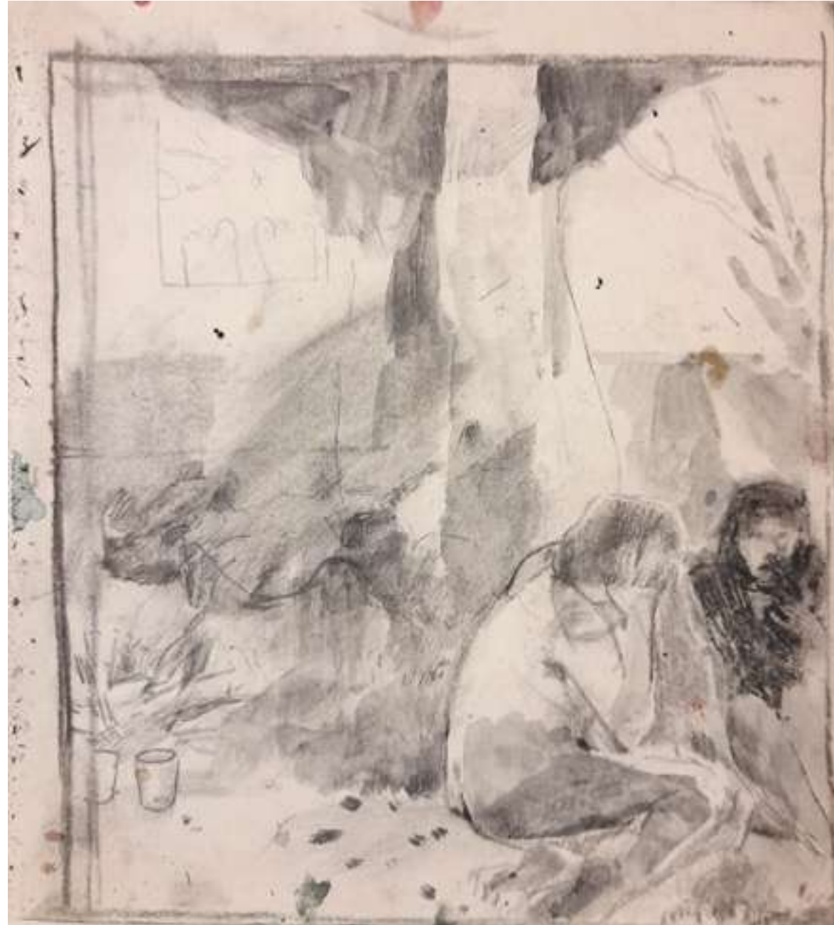
Study 3 Pencil/wash on paper Joana Galego