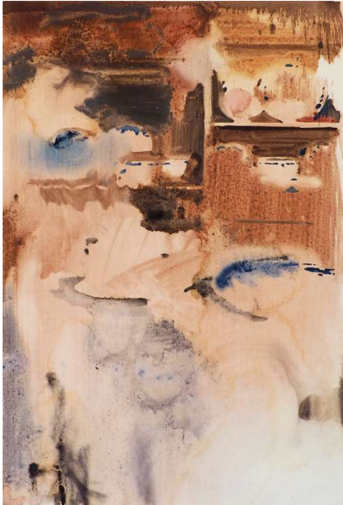
Dresser Oil on paper 33x23cm Eleanor Watson