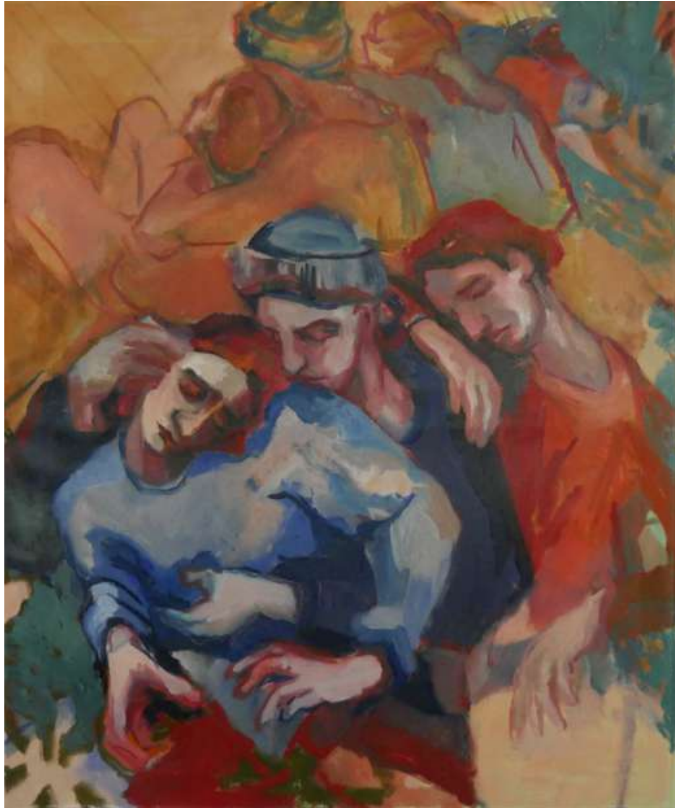
Huddle Oil on Canvas 100x120cm Rachel Mercer