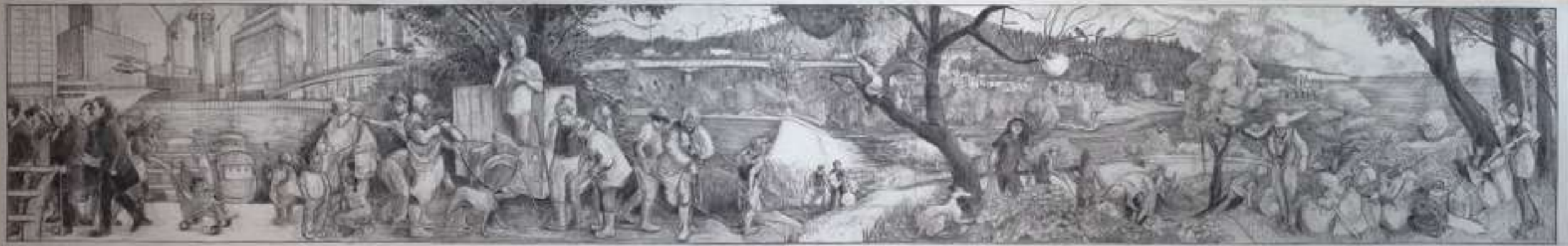
The Closer We Are Charcoal on Paper 48x366cm Geraint Ross Evans £2500