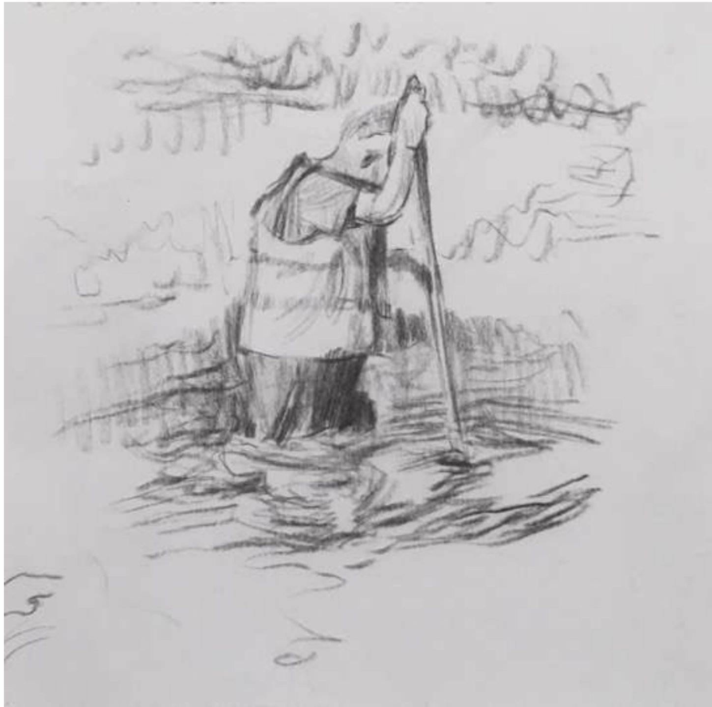
Cardiff Rivers Group Study (Wader) Charcoal on Paper 20 x 20cm (Aprox) Geraint Ross Evans