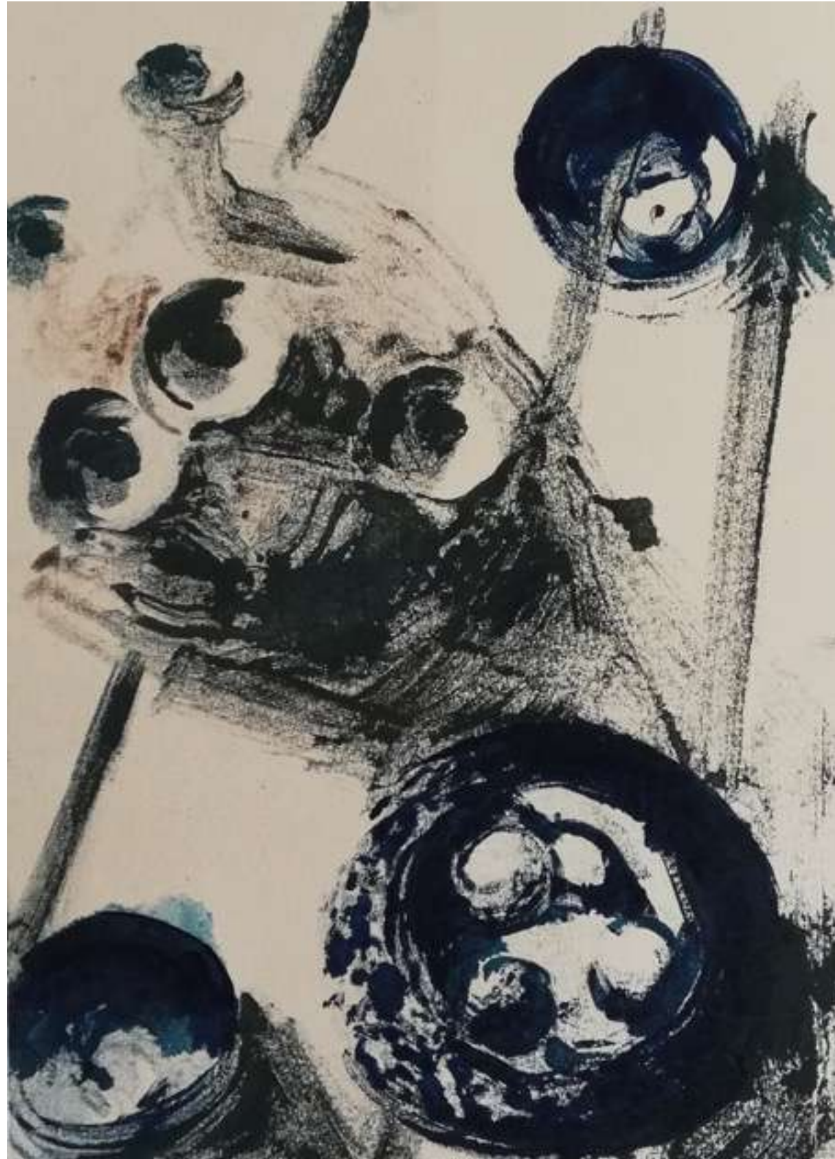
Table II Montotype on paper 22x29cm Tim Patrick