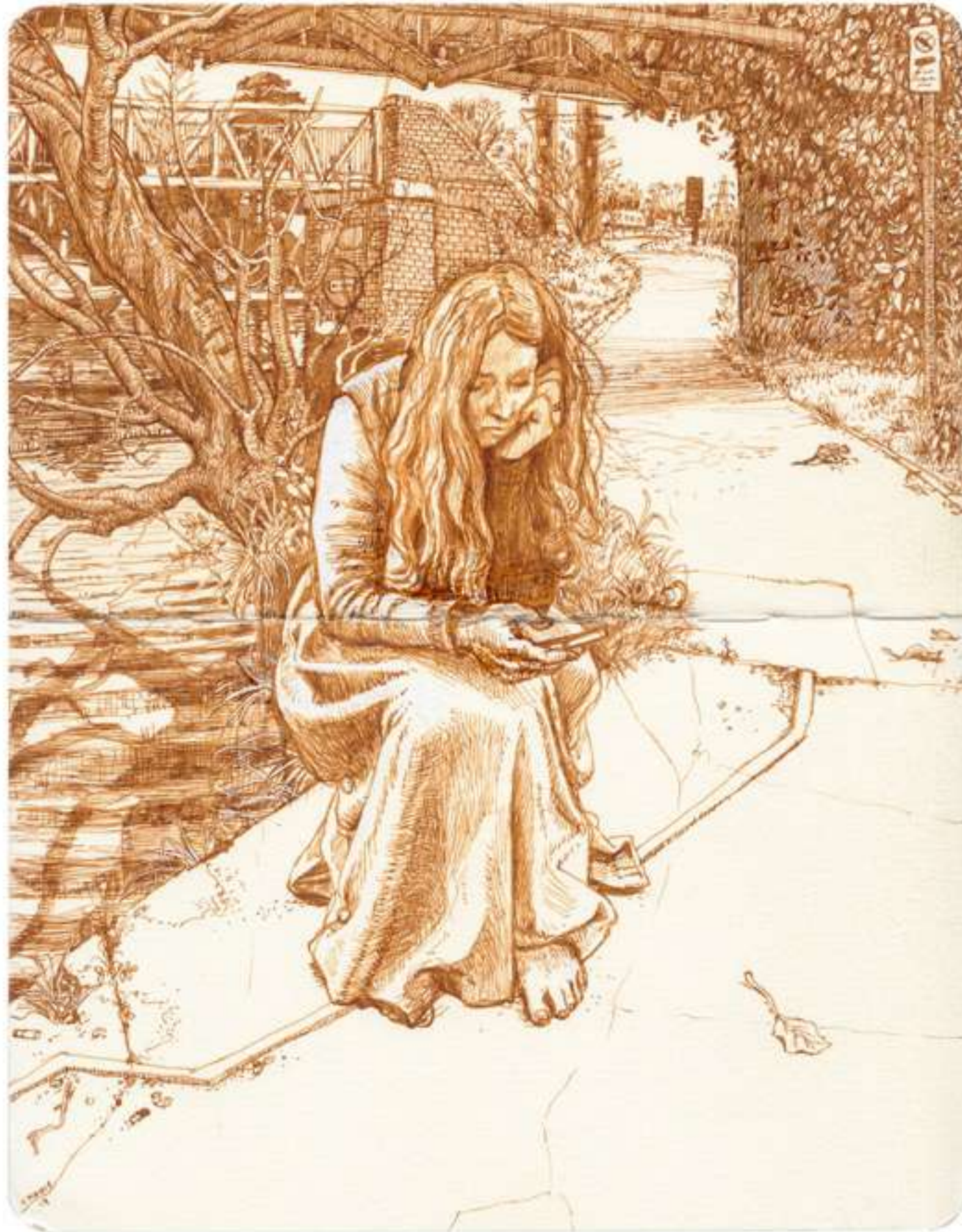
Modern Melancholy Ink on paper 27 x 21cm