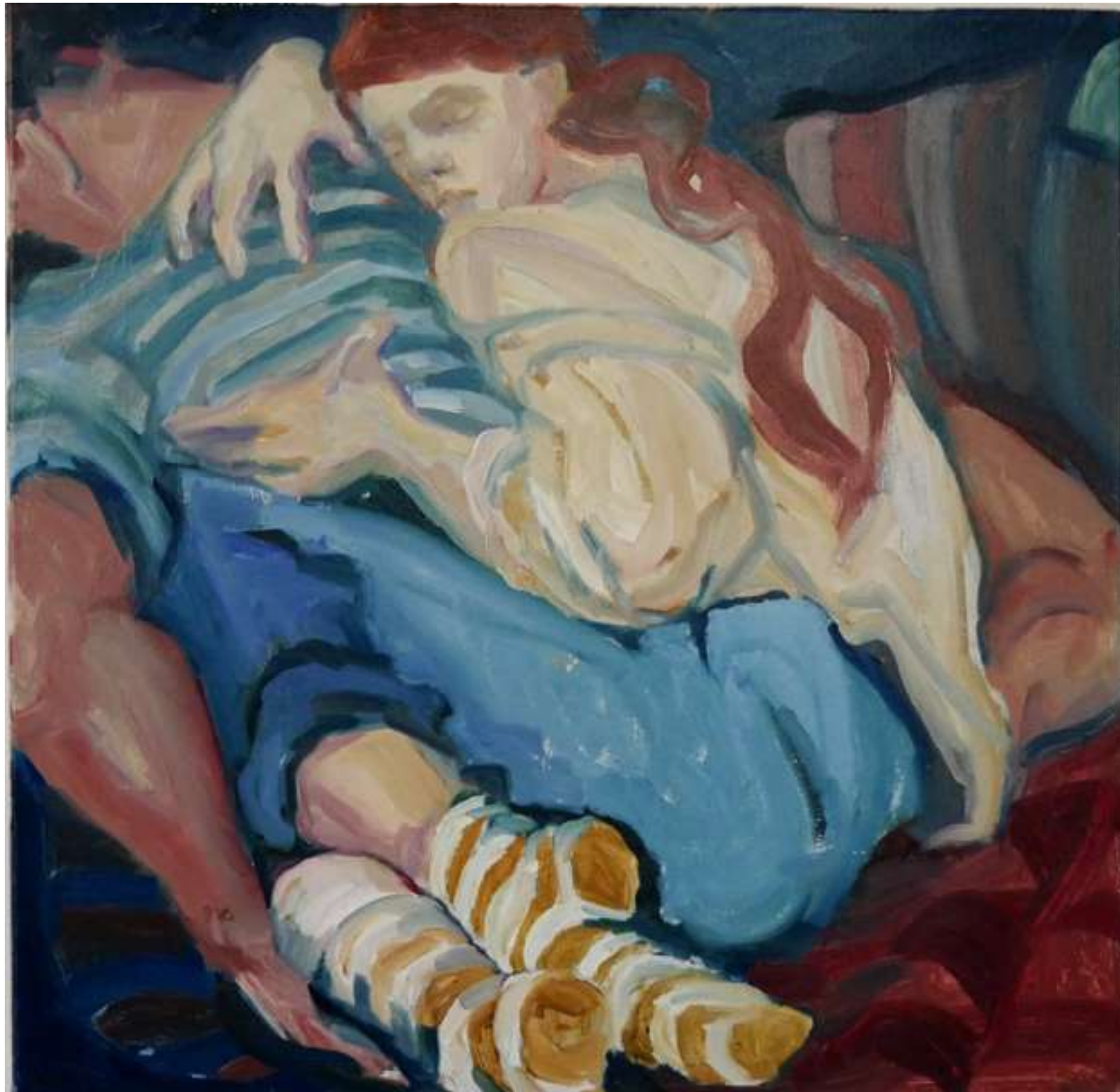
Taking Oil on Canvas 60x60cm Rachel Mercer

She paints figures to express perception of the self; exploring reality through sensual and bodily experience. Human figures meet the world and each other, exploring physical and emotional connections through dynamic and contorted positions, evoking the figure's struggle for meaning and virtue. Space around figures becomes distorted or fragmented, reflecting their being-in-the-world.