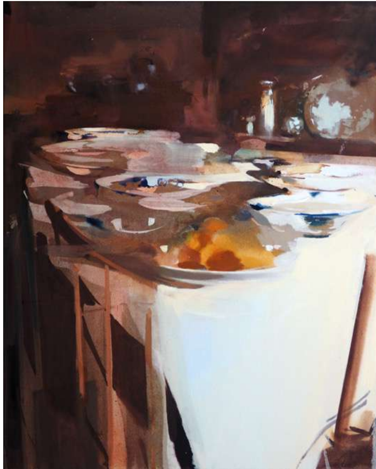
The Doors No Longer Hang True

Eleanor works primarily in paint and print. Her most recent works frame moments of light; passing across objects within the home. Melancholic images are washed in colour and come in and out of focus; creating quiet moments in which to contemplate memory, and longing in image-making.