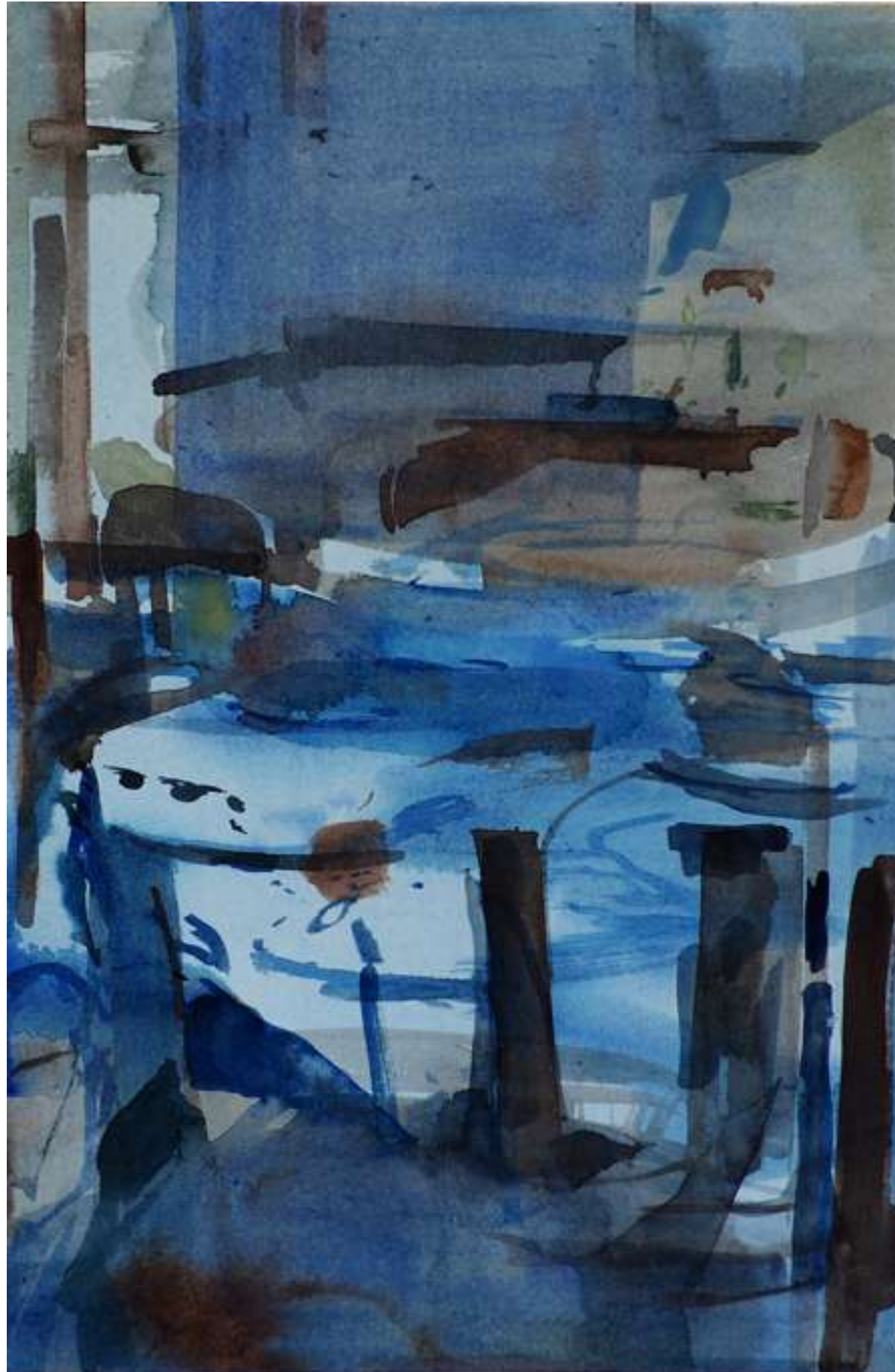
Blue Tablecloth Watercolour on paper 37.5x25cm Eleanor Watson