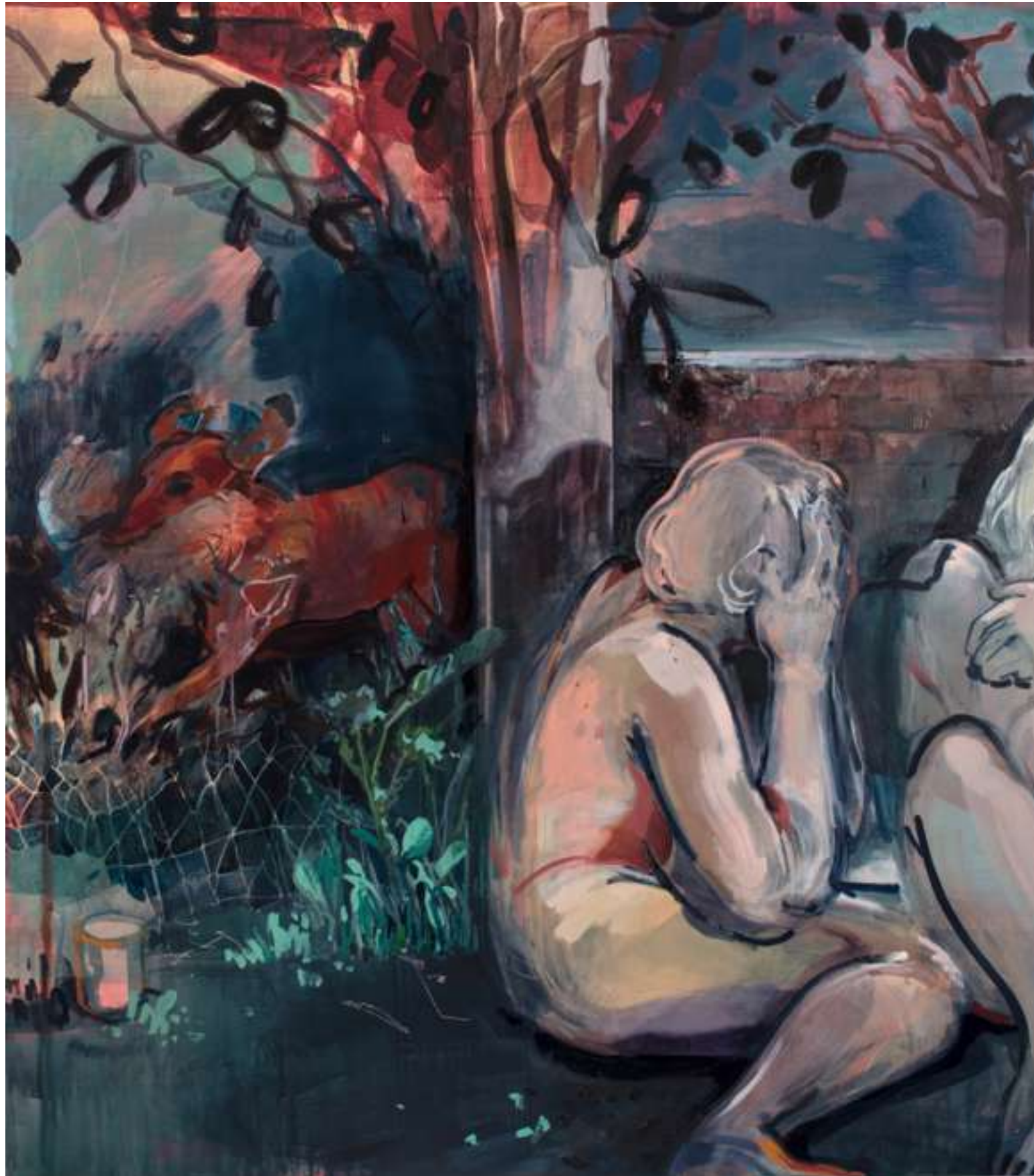
Go Gentle Acrylic and oil on canvas 170x154cm Joana Galego

In addition to various international private collections, Galego's work is found in the Royal Collection Trust of the British Royal Family, UK. Recent solo exhibits include the Royal Drawing School, London, UK, 2019 and the Museu das Artes de Sintra, Portugal, 2016. The artist has participated extensively in group shows including Galeria da Junta de Freguesia de Santa Maria Maior, Lisbon, Portugal, 2019; British Museum, London, 2018; Cave Space, London, 2018; Leegate House, London, 2018; Royal Drawing School, London, 2017; Christie's King Street, London, 2017.