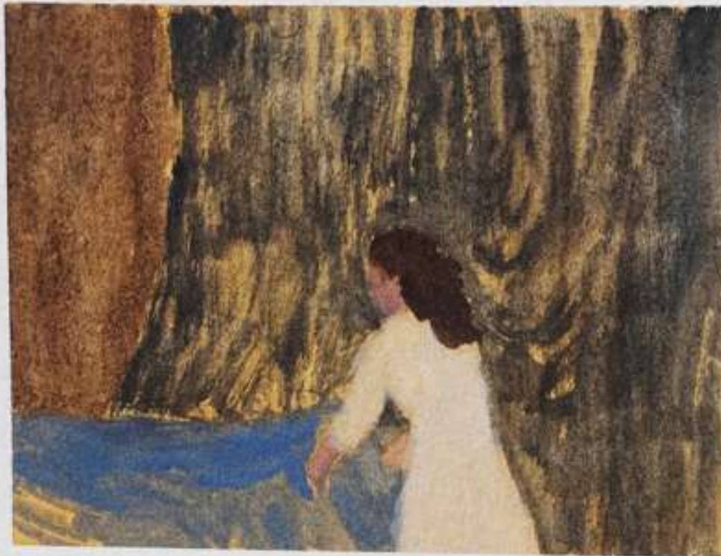
Making the Bed Watercolour on paper 7x5.3cm Bobbye Fermie