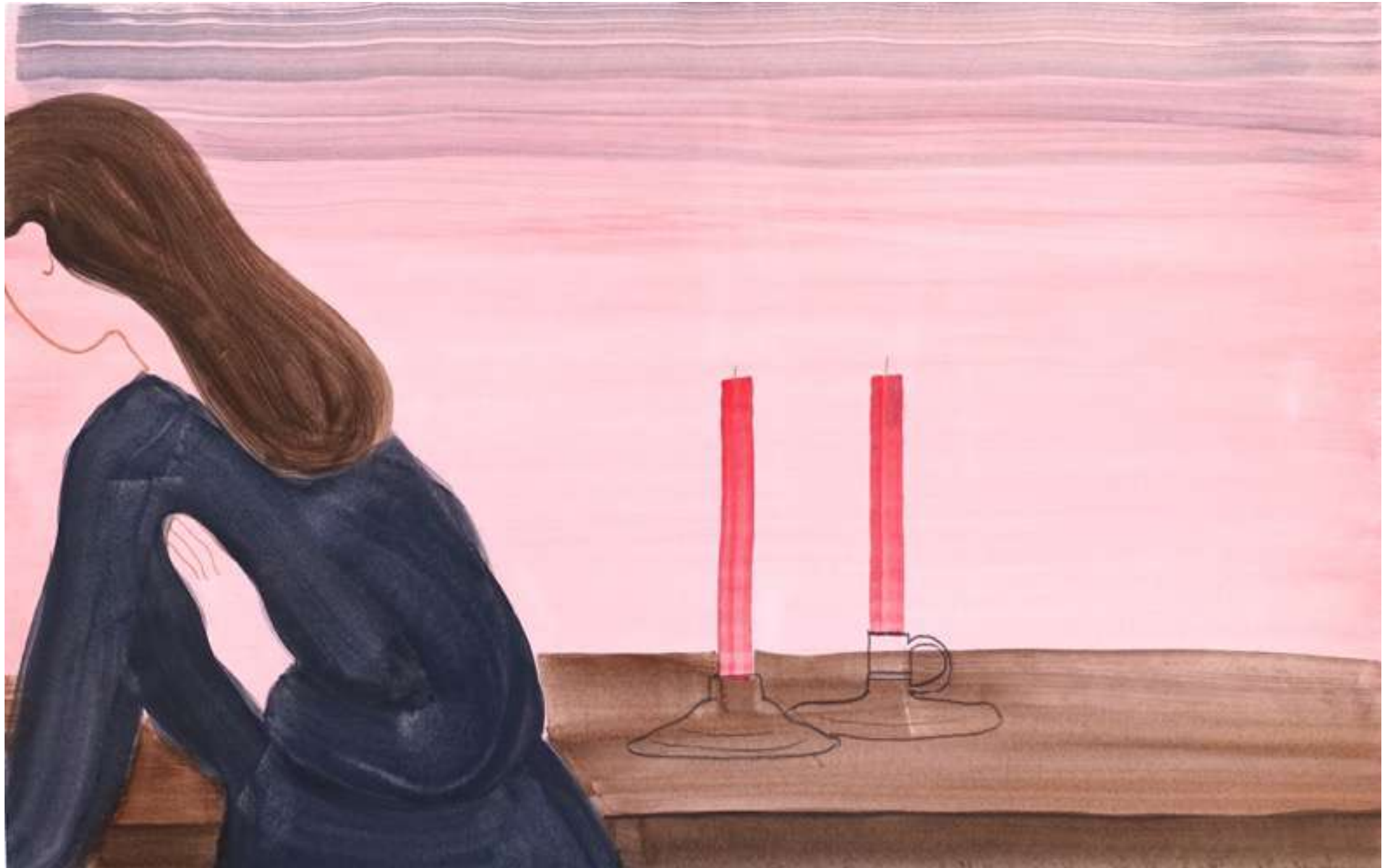
Before the Night Watercolour on paper 34x21cm on Paper Bobbye Fermie