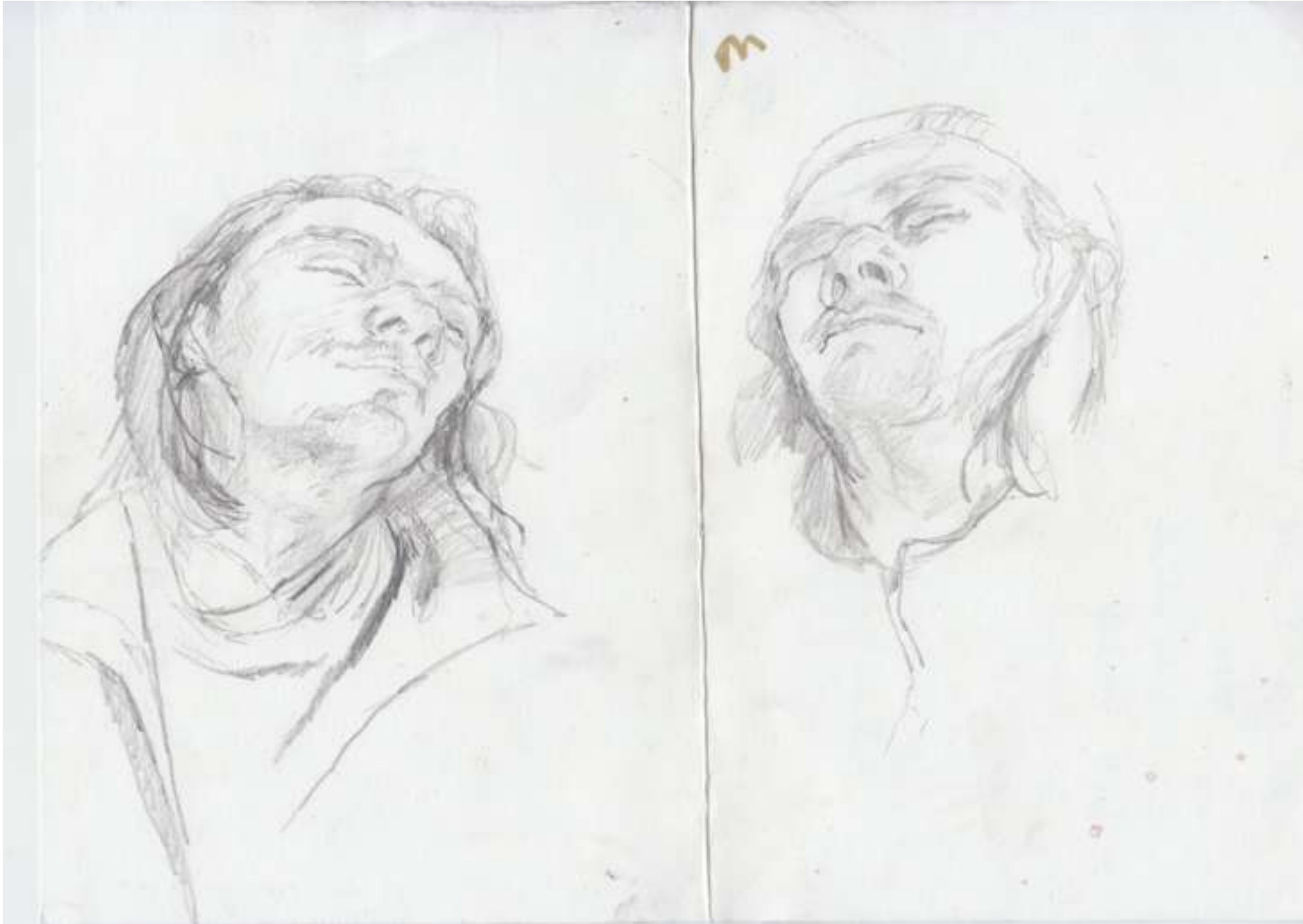
Drawing for Fold Pencil on paper 27x20cm Rachel Mercer