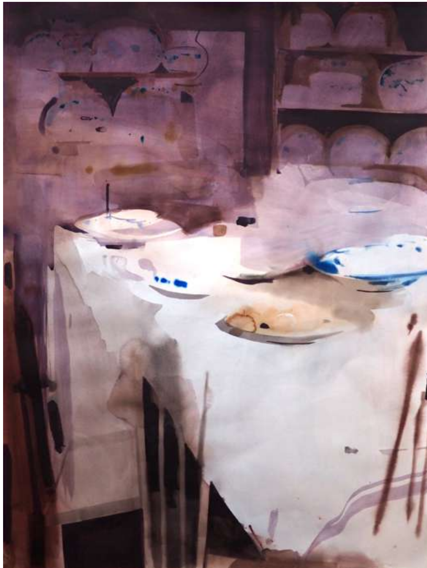
The Doors No Longer Hang True 2 Watercolour and gouache on paper 148x111cm Eleanor Watson