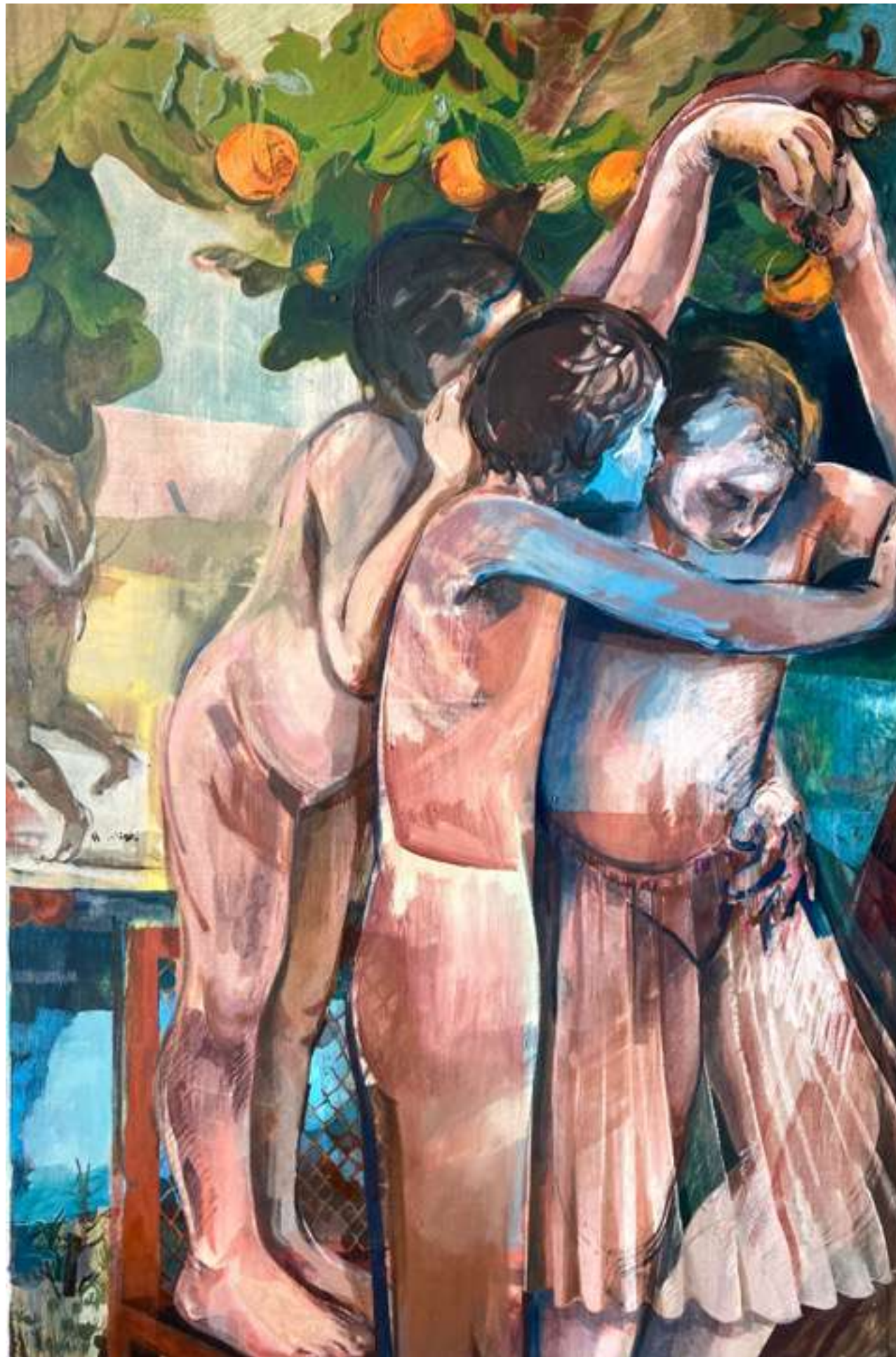
Mother fleeing as a teen Oil on linen 160x105cm Joana Galego