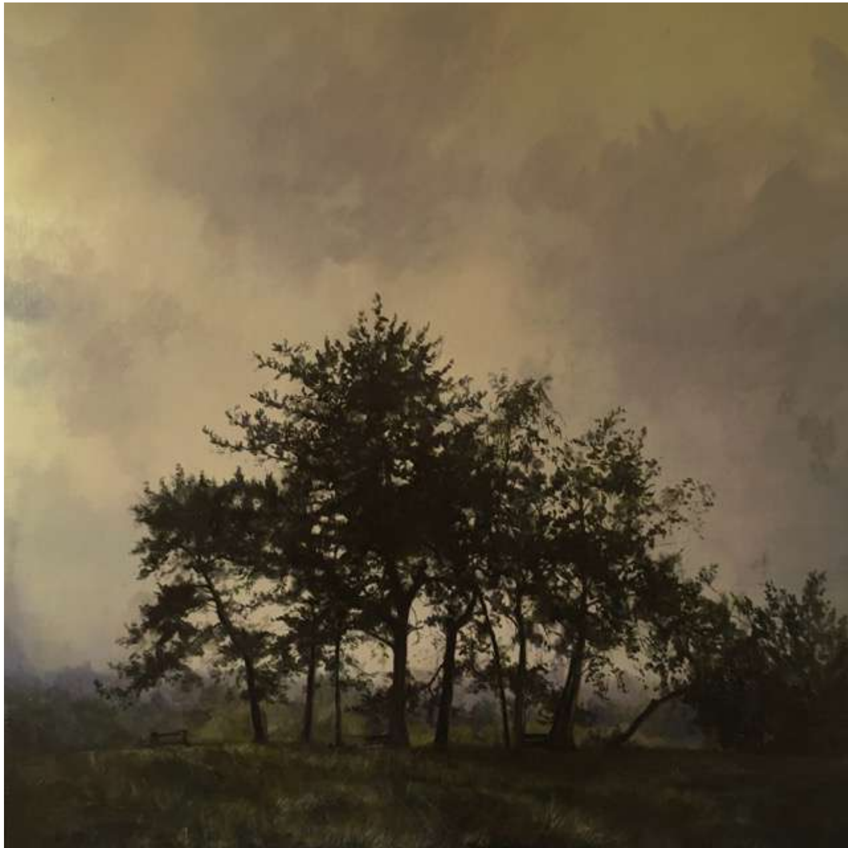
Hampstead Trees Acrylic and oil on board 110x110cm Fraser Scarfe