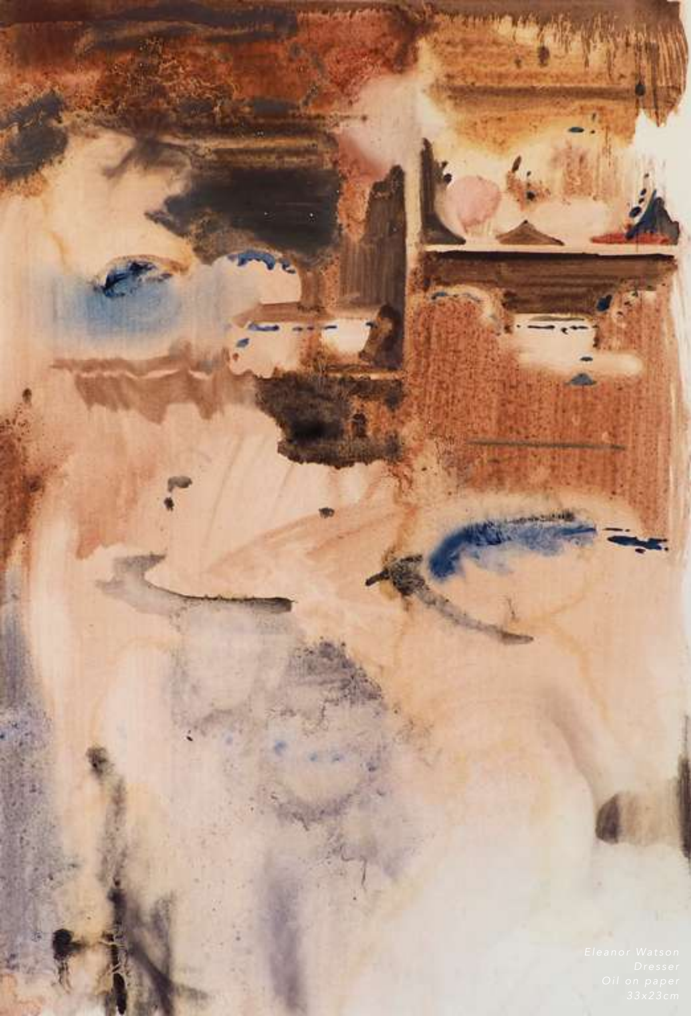
Eleanor Watson Dresser Oil on paper 33x23cm