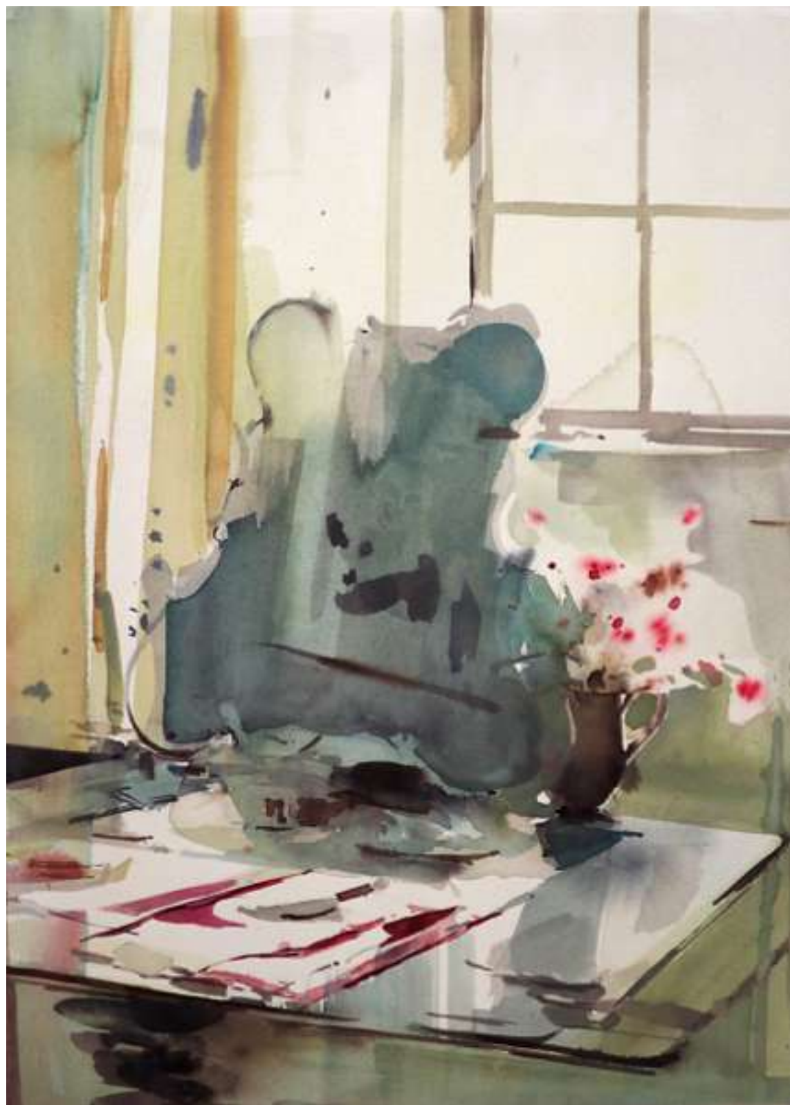
Shifting Clarities Watercolour on paper 71x51cm Eleanor Watson