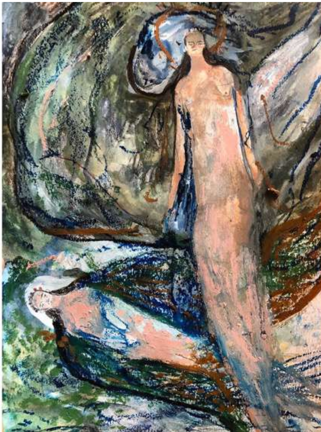
Where do Angels go when they die? Acrylic, watercolour and crayon on paper 21x29cm Melissa Kime