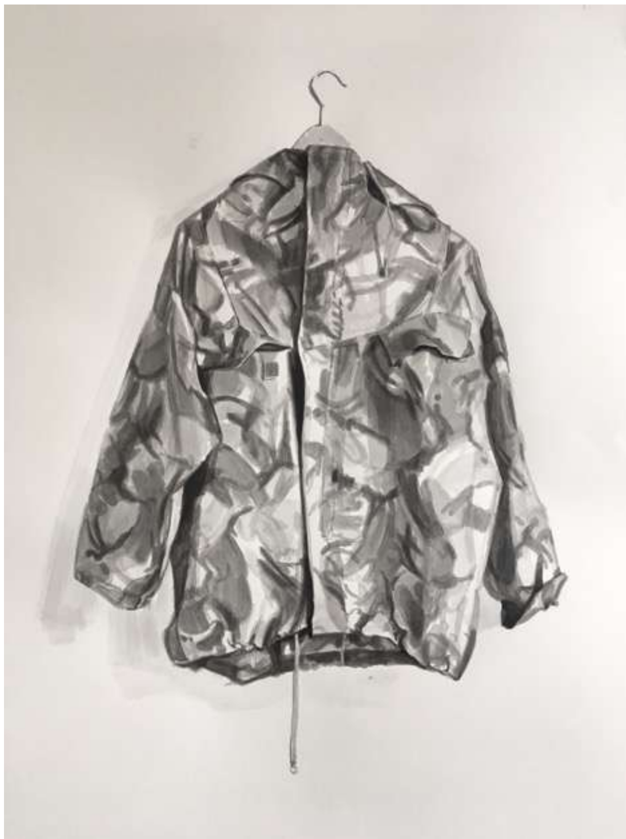
Camo Jacket Study Brush and Ink 30 x 45cm (Aprox) Geraint Ross Evans